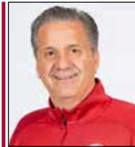
John CALIPARI Head Coach