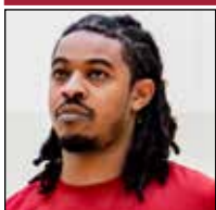
Tyler ULIS Basketball Assistant