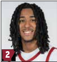
Boogie FLAND Arts & Sciences